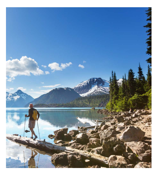
Whistler, BC, nearby Vancouver

Vancouver is one of the most livable cities in the world. It's consistently ranked near the top of renowned lists such as the Economist's "most livable cities," Mercer's Quality of Life Survey's top five, and Siemen's Greenest Cities in the World list. Vancouver's economic prosperity is impressive, and it's projected to have one of the fastest-growing metropolitan economies in Canada.