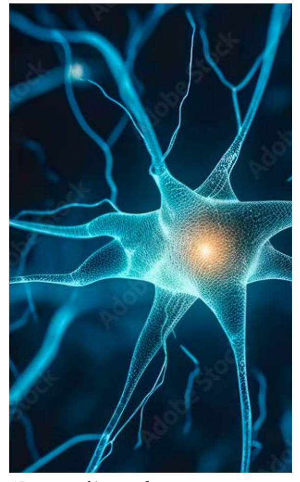
AI-generated image of neurons