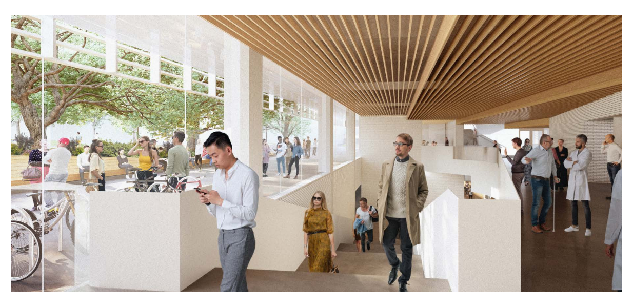
The Centre for Brain Health, top, and an interior rendition of the new SBME building, bottom